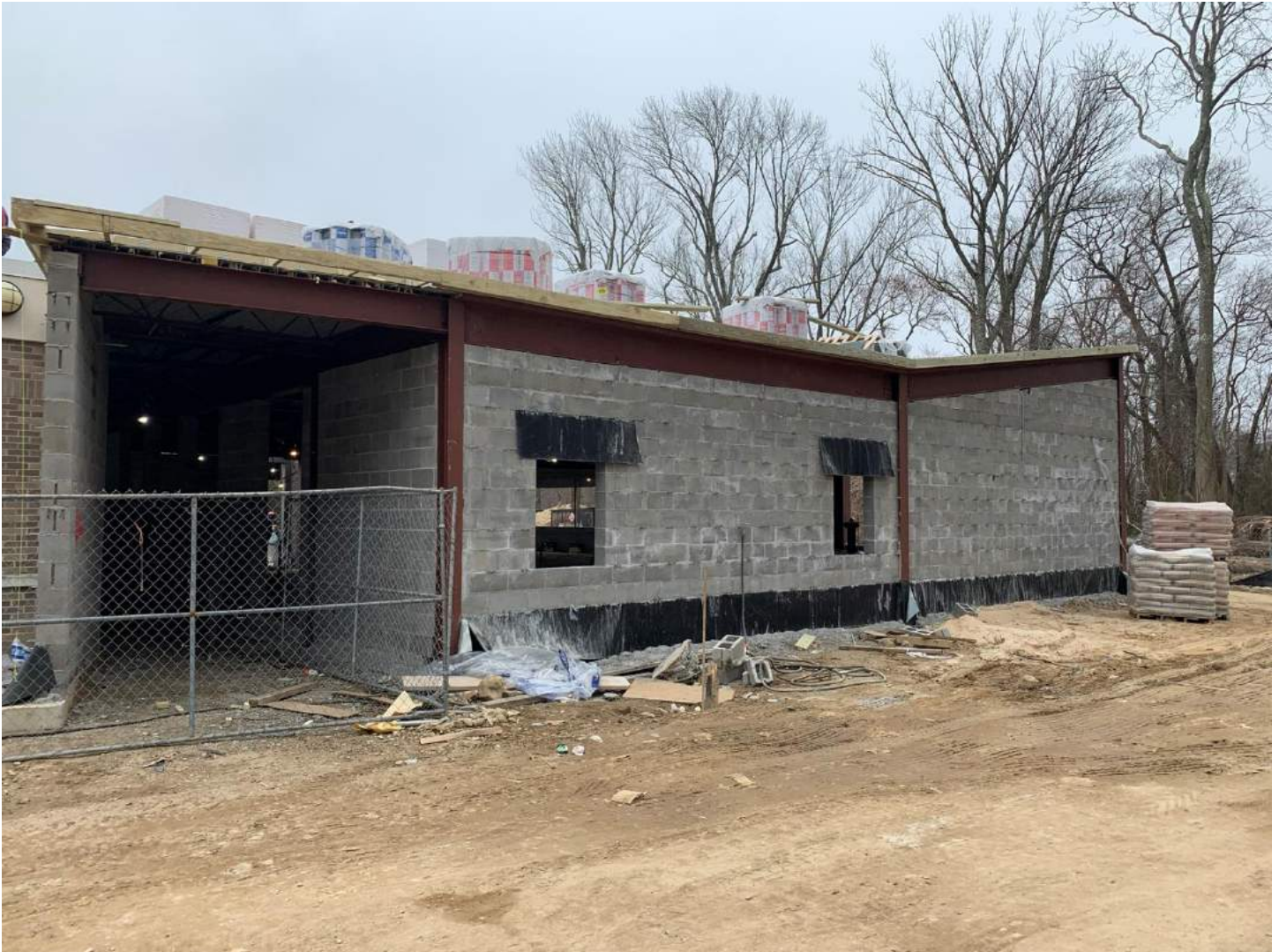
Jr/Sr HS New Addition Masonry Block Walls