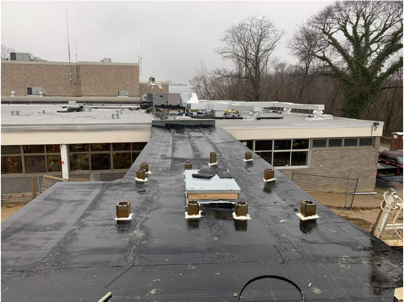
Jr/Sr HS New Addition Roofing Installation