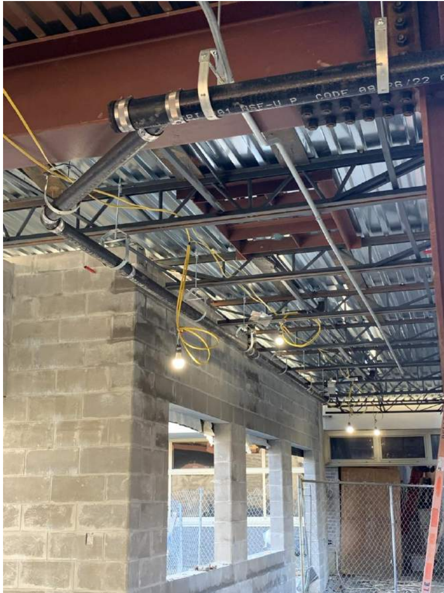
Jr/Sr HS New Addition Storm Water Drainage Piping