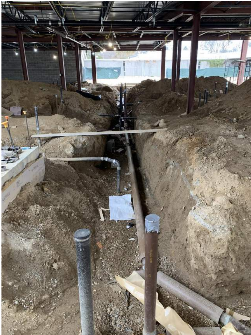
Jr/Sr HS New Addition Acid Waste Piping