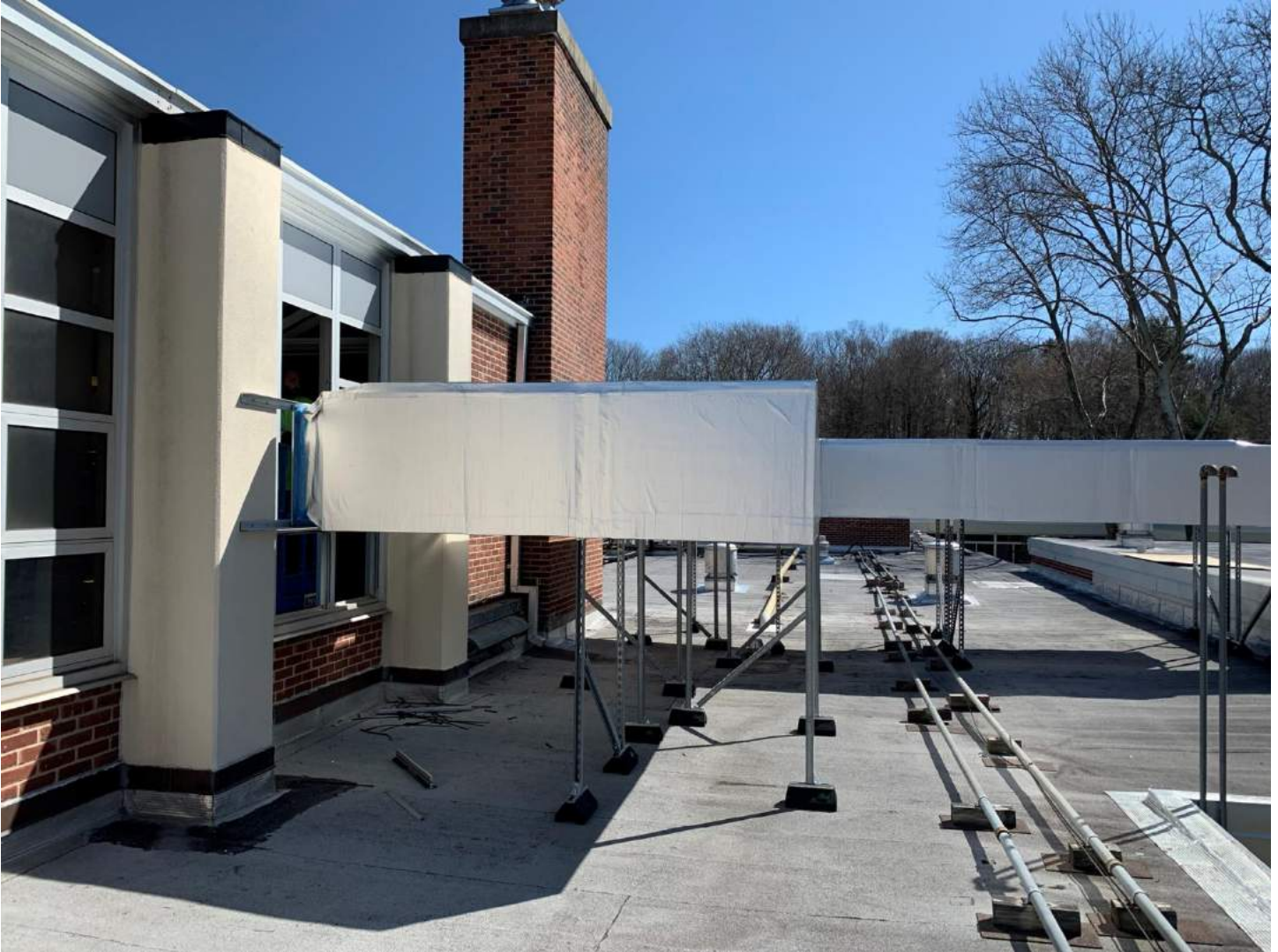
GooseHill PS AP Room Ductwork