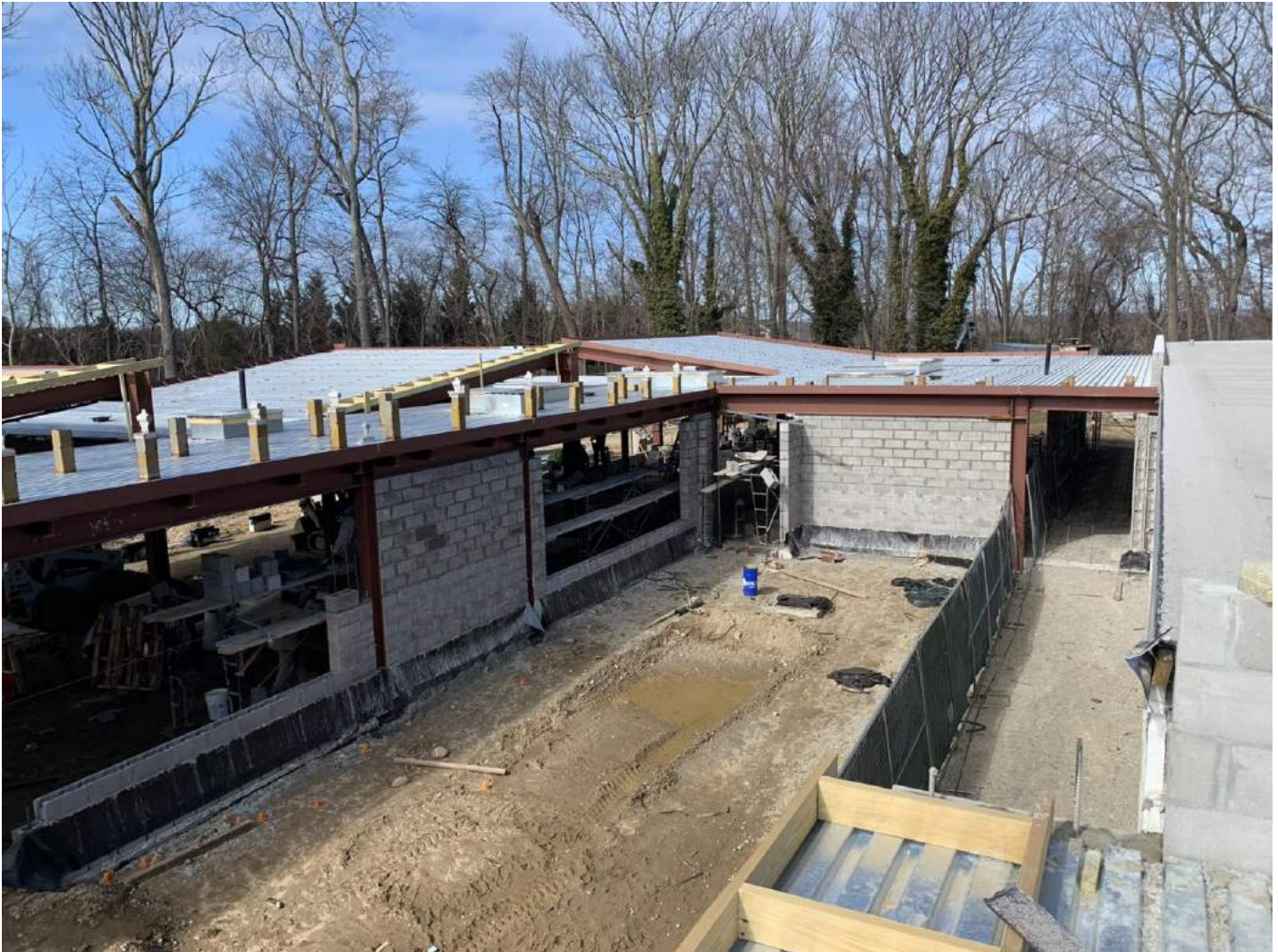
Jr/Sr HS New Addition Masonry Walls