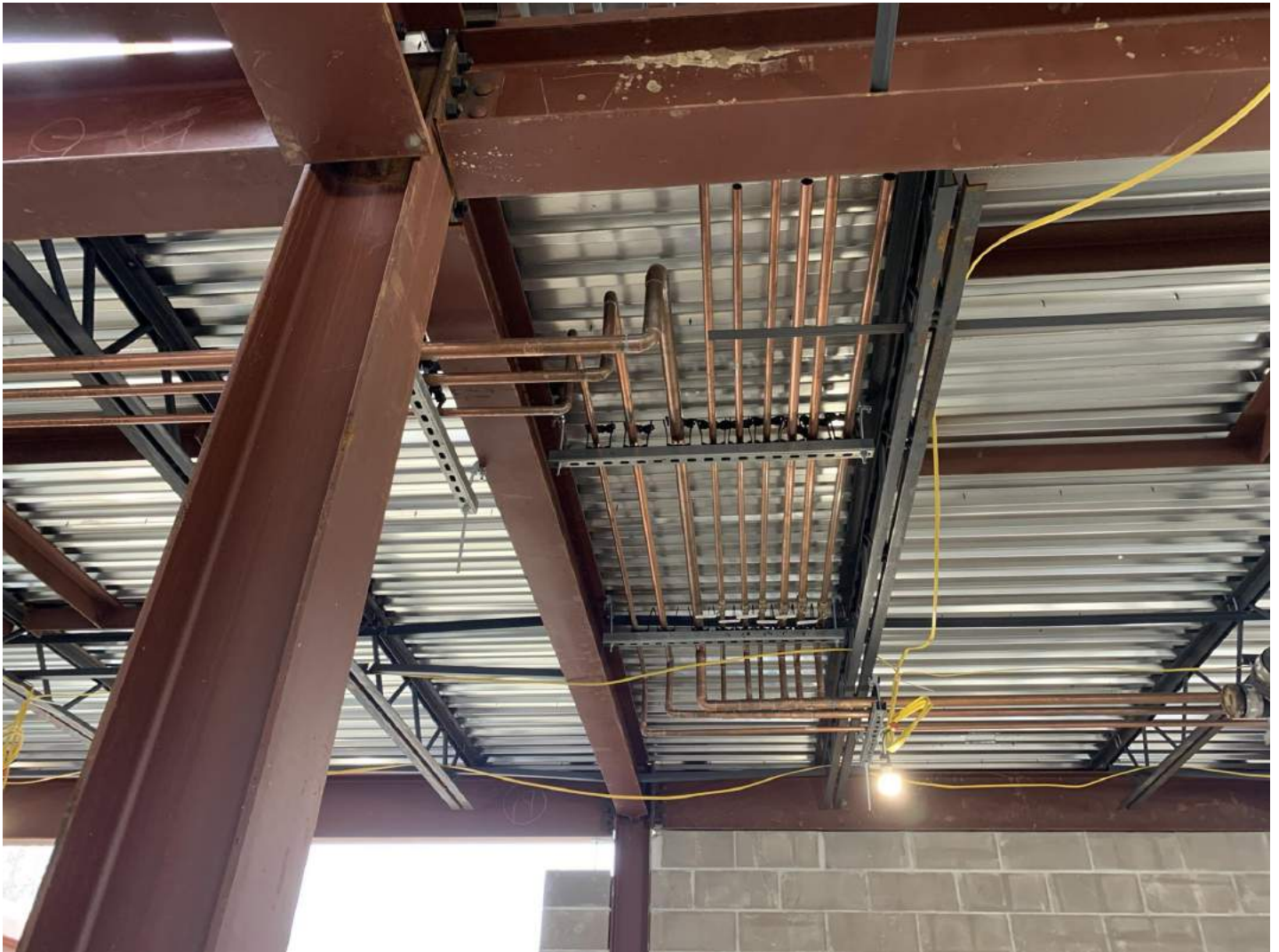
Jr/Sr HS New Addition Overhead Domestic Water Piping