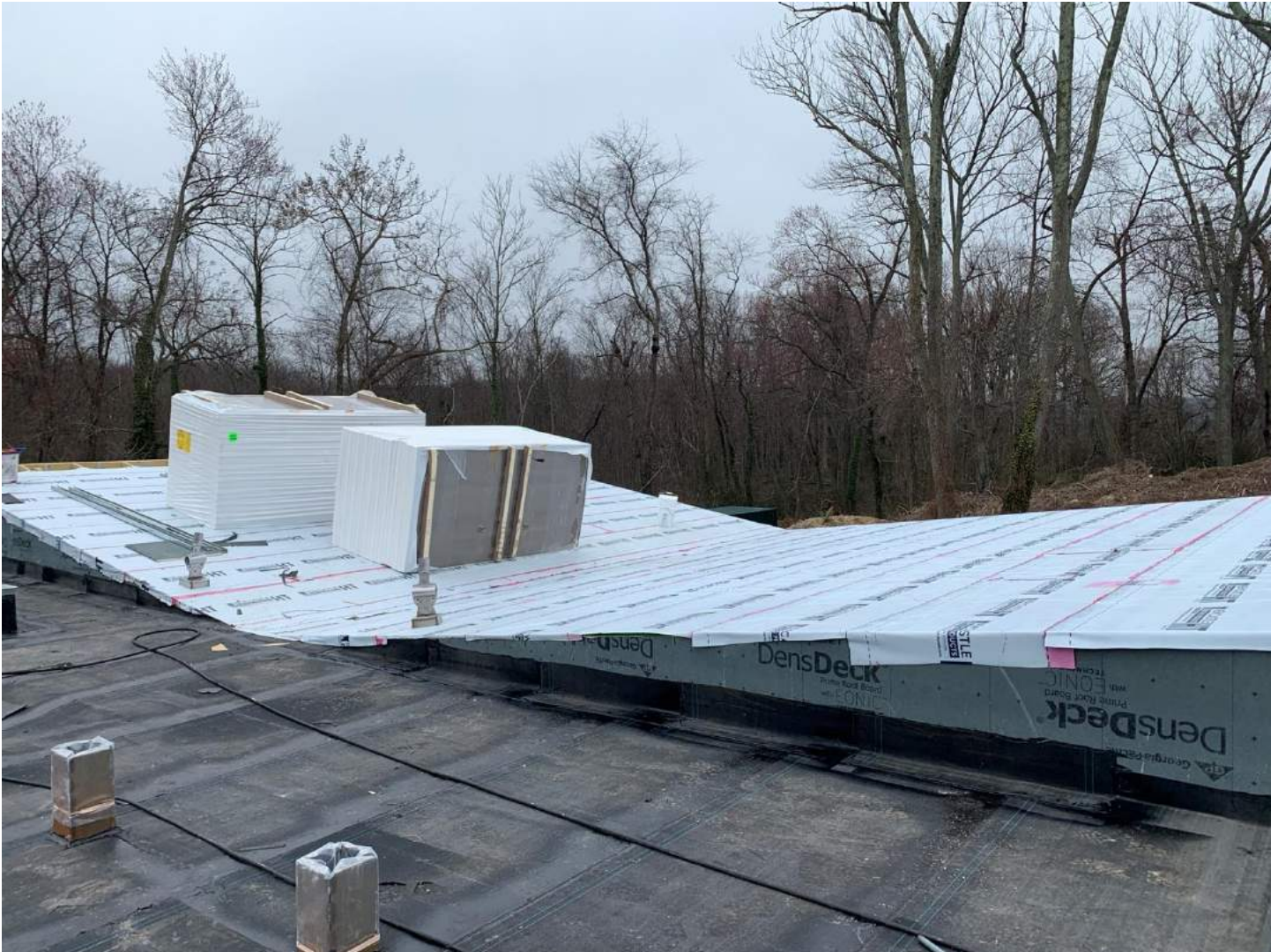
Jr/Sr HS New Addition Sloped Roofing Installation