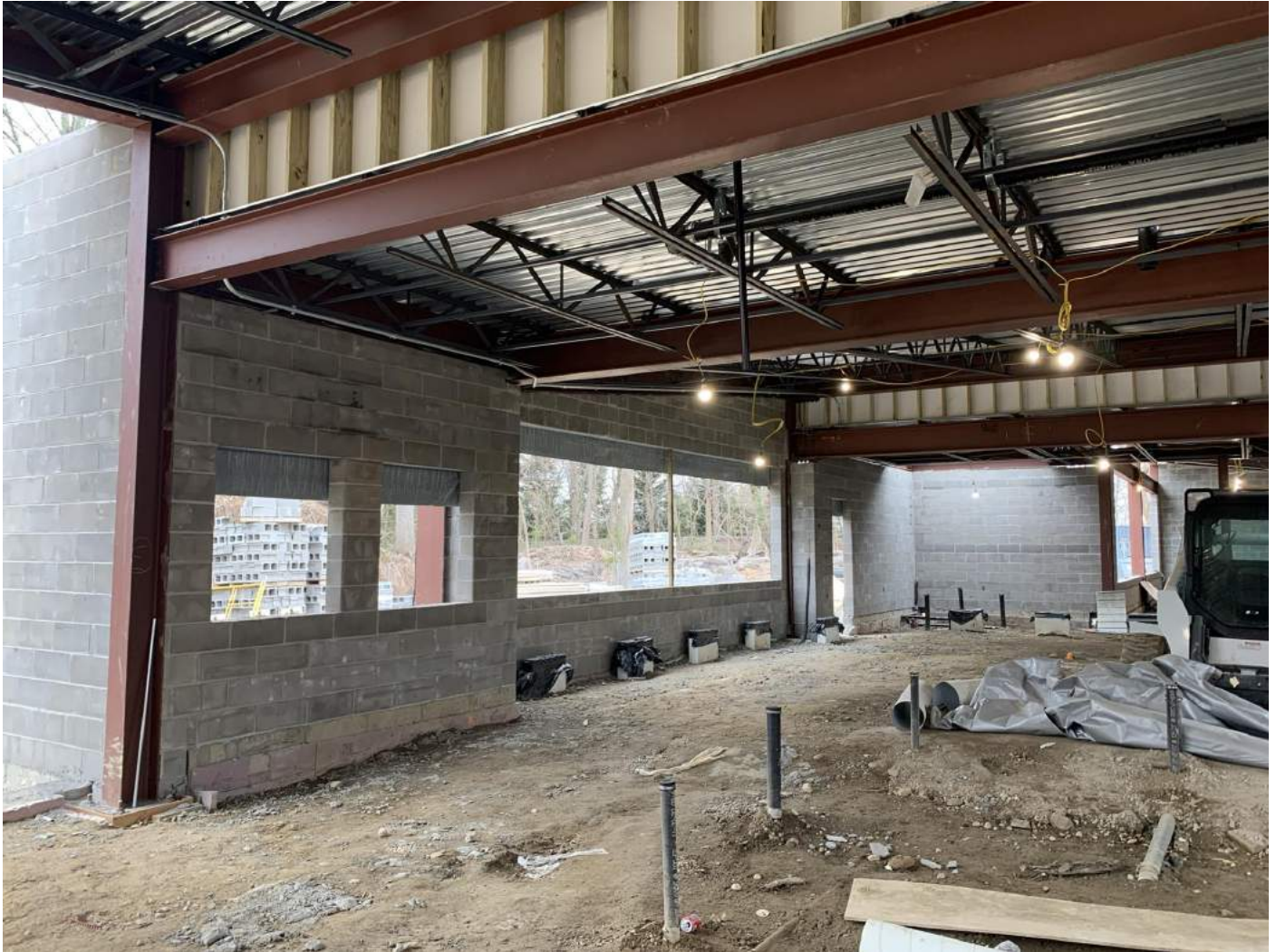
Jr/Sr HS New Addition Masonry Walls