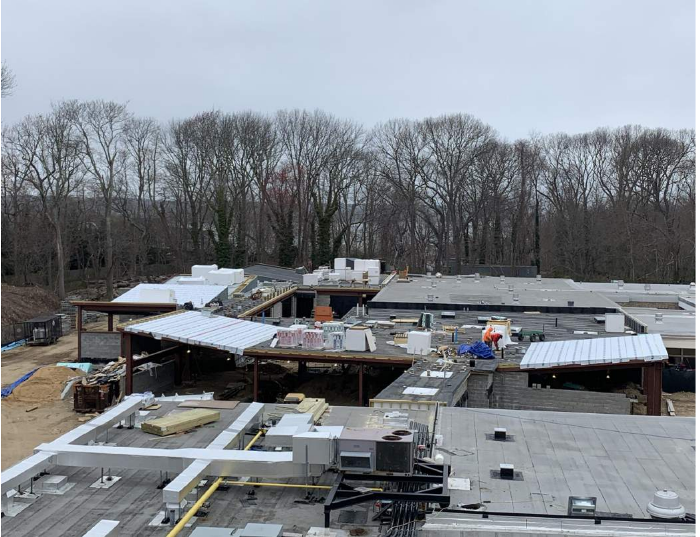
Jr/Sr HS New Addition Roofing Installation